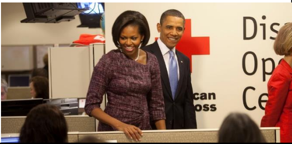
President Obama and First Lady Michelle Obama visit the American Red Cross.